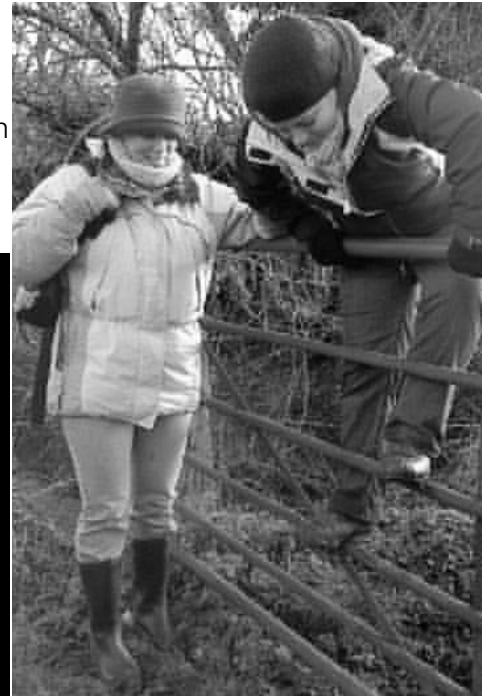
Enjoying a walk in the green belt

When found we will be fighting for the same approach to be adopted in Barnet.